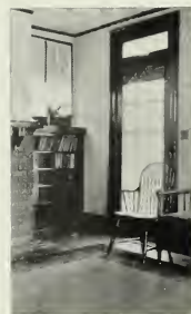
THE HOME ECONOMICS COTTAGE, WHERE STUDENTS LIVE AND LEARN BY ACTUAL EXPERIENCE THE PRACTICAL APPLICATION OF MODERN HOUSEKEEPING